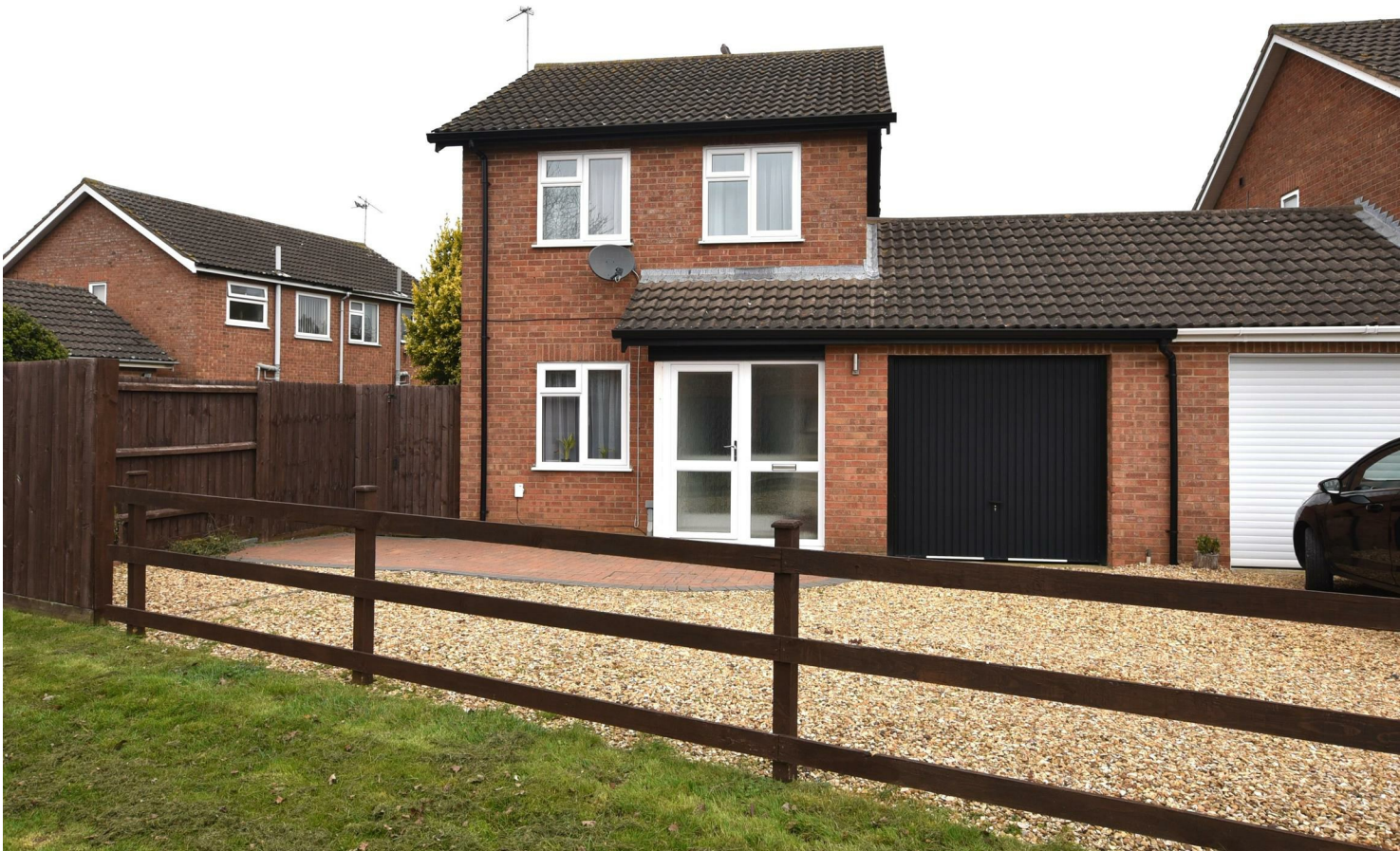
79 Arran Road, Stamford, Lincolnshire, PE9 2XT